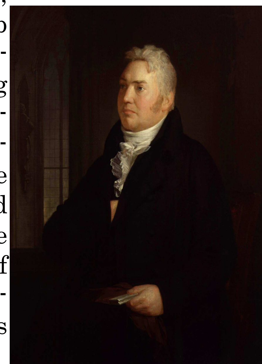
S. T. Coleridge, British poet and philosopher

I organized, chaired, and presented work at an international conference at Kyoto Notre Dame University on this theme. I am also organizer, chair and presenter of a follow-up conference at Cambridge University. I am editing a book collecting essays developing from these conferences, as well as writing a single-author monograph on the theme. I have recently published related articles in The Coleridge Bulletin , and in The Journal of Philosophy of Life , and am currently writing an essay on poetics for Oxford University Press.